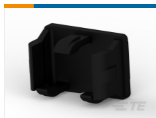
TE Part # 1367147-1 SFP COVER, UNPLATED