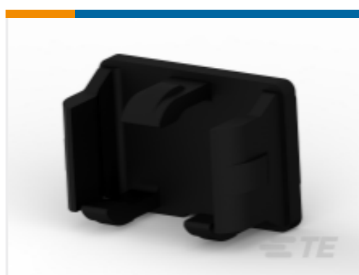
TE Part # 1367147-3 SFP COVER, UNPL, NO LOGO