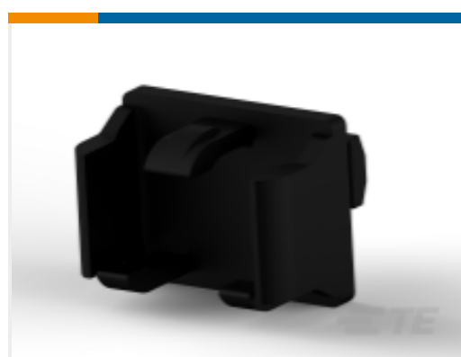
TE Part # 1761394-1 DUST COVER, SFP, GANGED & STACKED